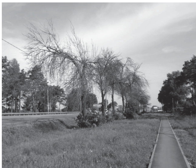
Figure 3. Dead ash trees along the federal highway M10 (Russia) between Moscow and Saint Petersburg, near settlement Zavidovo. July 1, 2016

served (Fig. 1, Table 1). Hundreds of ash trees were also surveyed in Tver City (Fig. 1). The great majority of these trees were healthy. Small entrance holes were observed on a few dead ash trees in Tver, which were considered to be the result of unsuccessful infestation attempts by Hylesinus varius (F.) (Curculionidae, Scolytinae). Neither emergence holes nor galleries of buprestids were observed in Tver City, despite the recent record of A. planipennis in a south-eastern district of the city (Peregudova 2016).