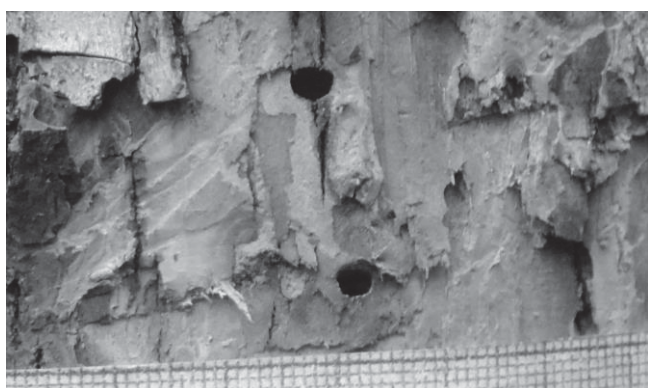
Figure 2. Typical D-shaped emergence holes of A. planipennis on an ash tree. Grid – 1 mm. July 1, 2016

emergence holes and dimensions of the exit holes with the transverse diameter exceeding 3 mm (Fig. 2). This diameter is significantly greater than that of other Agrilus species breeding on ash in the region. The GPS coordinates of each site were recorded using a Garmin GPSmap 60Cx navigator (Table 1).